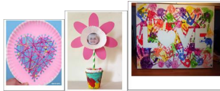
15 th March – Recycling Day Box.